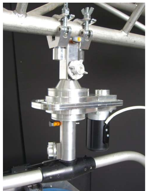
Pan drive, hanging version