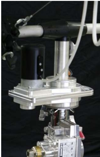
Pan drive, standing version

When mounted hanging, the rigg adapter is used: