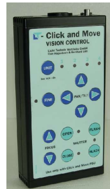
Wired remote control