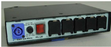
Power supply with motor electronic