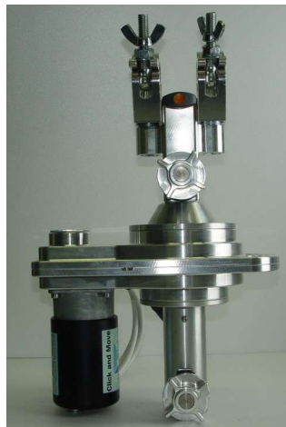
Rigg Adapter mounted