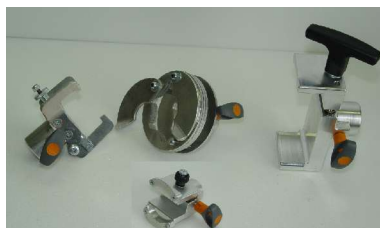
Different Focus adapters