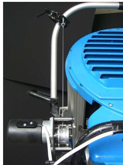
Tilt drive, hanging version

Please note: Depending of the winding direction, the UP/DOWN keys can be interchanged!