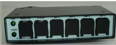
MuxBox (for 2 up to 4 systems)