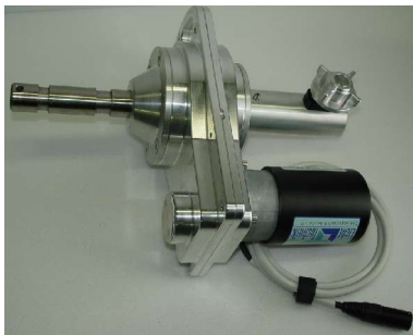
Pan motor and gearbox