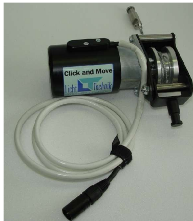
Tilt motor and gearbox