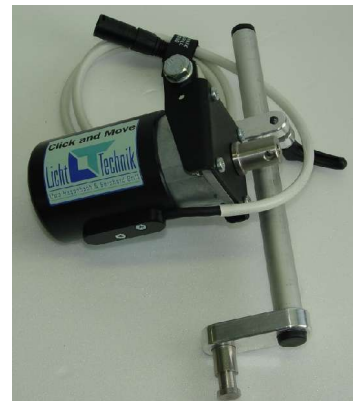
Focus motor and gearbox