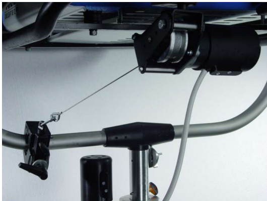
Tilt drive, standing version

The reel can be released by pulling it away from the motor. Now the rope can be unwinded manually.